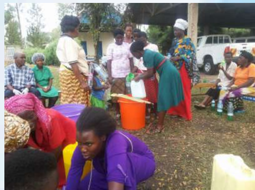
Teaching Liquid soap making at Divine Hearts Training Institute