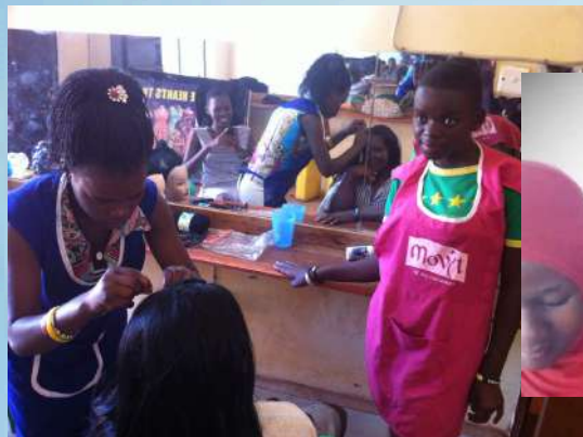
Conducting a Hairdressing Class at Divine Hearts Training Institute