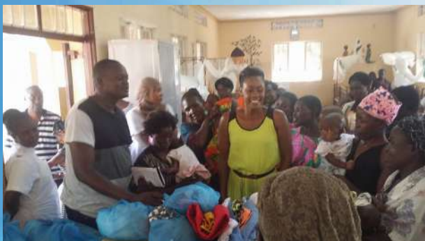
Distribution of Food to single young mothers at Nalufenya Hospital, Jinja