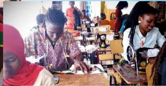
Tailoring, Fashion & Design Class at Divine Hearts Training Institute